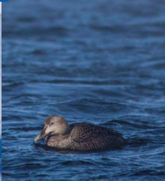
Arctic Eider Duck