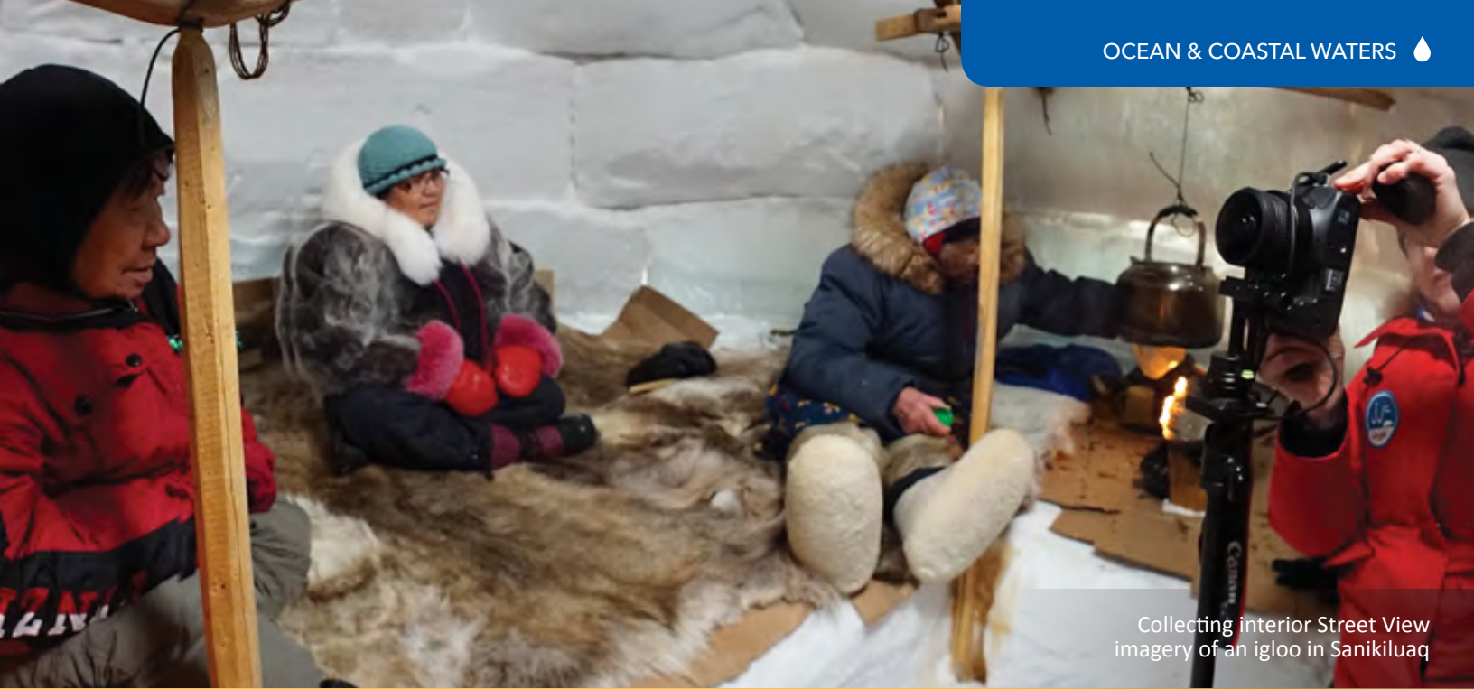
Collecting interior Street View imagery of an igloo in Sanikiluaq