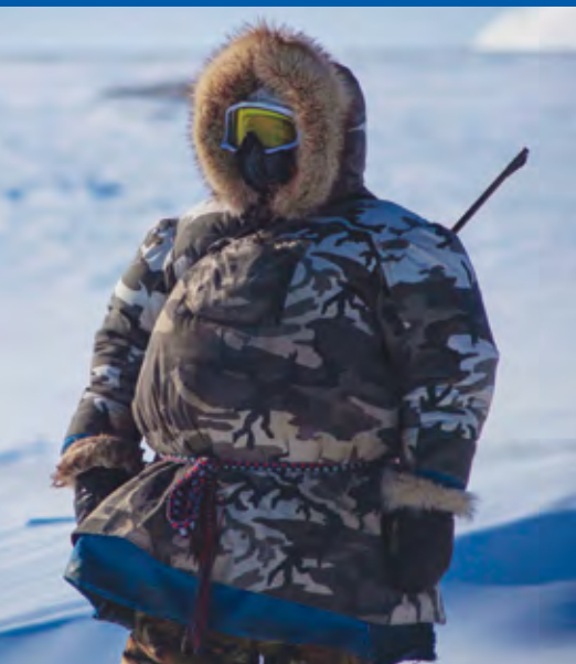
On the lookout for Polar Bears